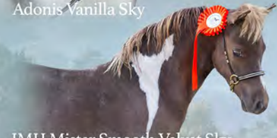
IMH Mister Smooth Velvet Sky