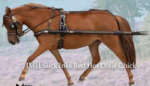
IMH Slick Inks Red Hot Dixie Chick