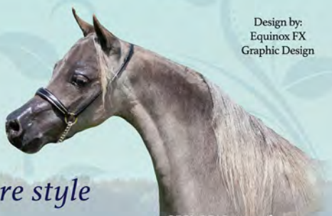
SHM Westernboys Femme Fatal