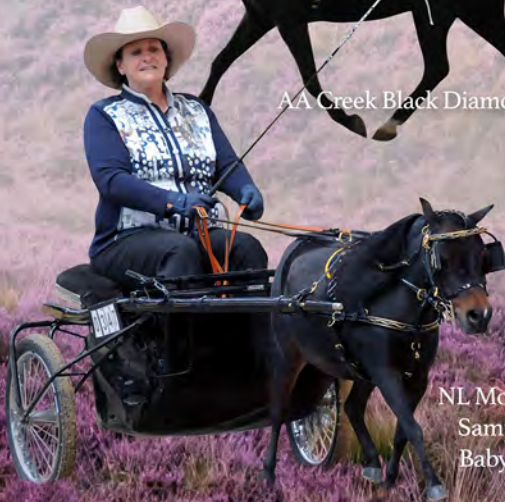
NL Moonlight Sampsons Babylonia