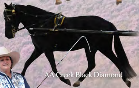
AA Creek Black Diamond