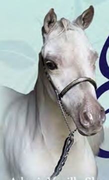
Adonis Vanilla Sky