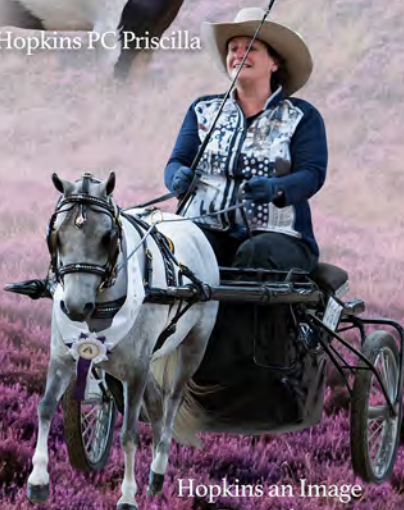
Hopkins an Image 2 Buzz About